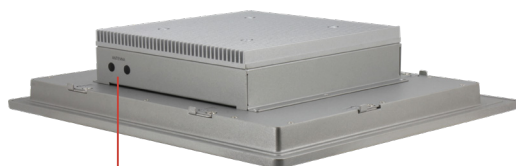
Antenna Hole x 2